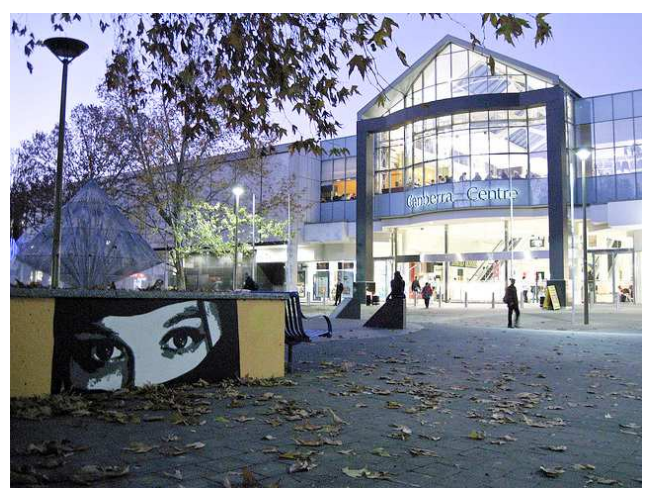
Above Walking up to the Canberra Centre...