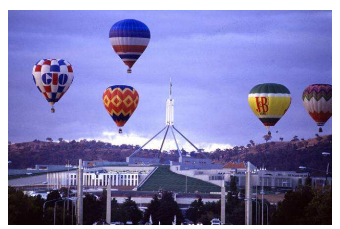
Above: Balloons flying over Parliament House