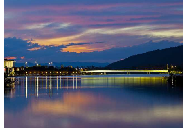
Above: Lake Burley Griffin

Hopefully a number of you are heading to Canberra soon for the AAIR SIG Forum. Here's a few photos of some of the sights. Just be sure to pack your scarf, gloves and beanie!! Also see the website 'Get Wrapt in Winter' http://www.wraptinwinter.com